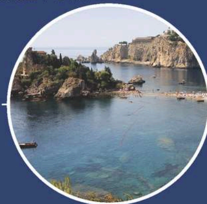
CATANIA CRUISE PORT