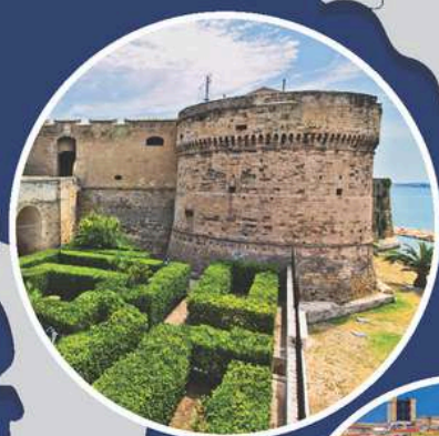
TARANTO CRUISE PORT